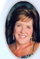
Robin Williams Church on the Hill