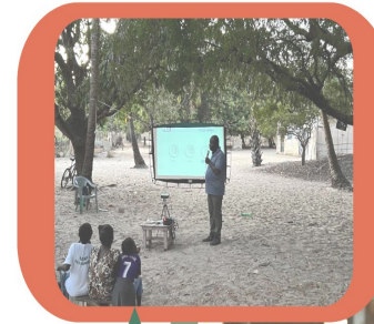
Projector Kits $2,058.00 per kit