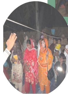
Projector kits are being used by trainers as an entry tool into new villages to share the Gospel. Here is a recent testimony and picture from our trainer in Pakistan. "Today I preach the gospel around a brick kiln!! And show them Jesus Film!! Around 7 families accepted Jesus Christ!! Hallelujah!!"