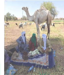
Camels are being used by trainers especially in the regions of North Africa where it is their main means of transportation. By partnering with the trainers there, you are equipping them with the means to cover large distances traveling, sharing the Gospel, and training up the local Church body with basic discipleship tools.