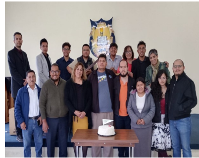
Students in Mexico

We thank the Lord for the brethren of White Hill COB partnering with us in prayer and financial support. You have helped keep this important ministry going.